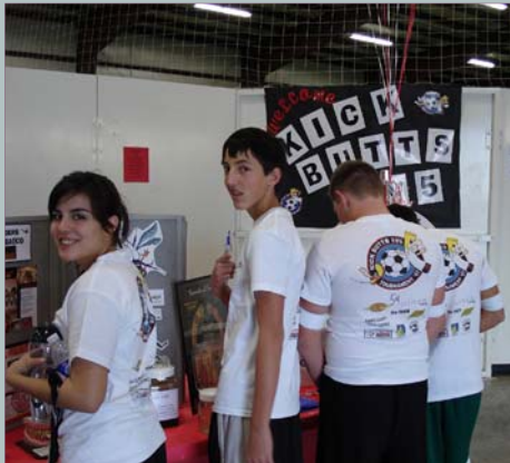
Kick Butts 5V5 soccer tournament participants visit tobacco booth and sign tobacco-free pledges, March 26-29, 2007 at Ultimate Indoor in Woods Cross.